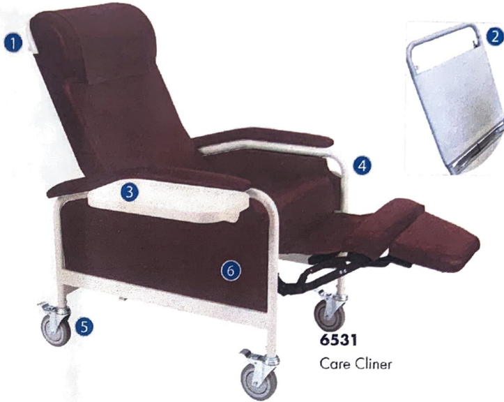
6531 Care Cliner