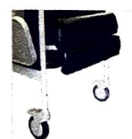
Leg Extensions REOO