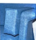
Side Cushion SCOO

COLORS Available in 40+ vinyl colors. Visit our website or contact us to request swatches.