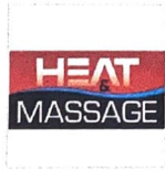
Heat HT Heat & Massage HM